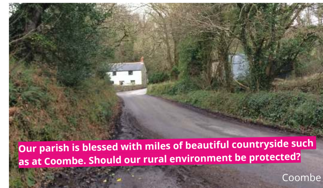
Our parish is blessed with miles of beautiful countryside such as at Coombe. Should our rural environment be protected?